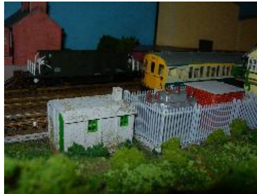
2EPB leaves for Dunton Green.