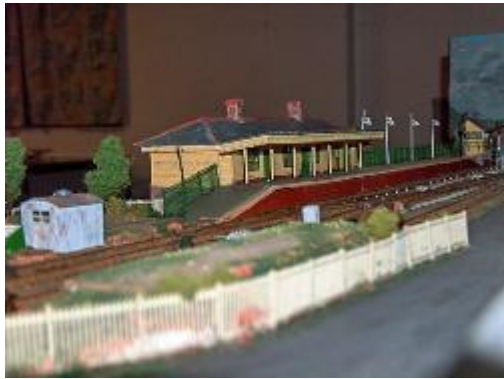
Westerham awaits the arrival of the next service.