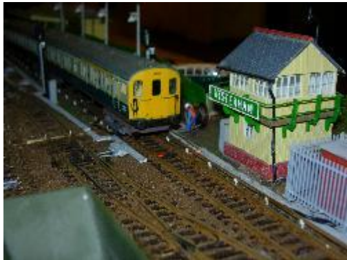
2EPB awaits departure.