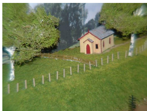
Tin Tabernacle re-erected by WVMRC as their HQ.