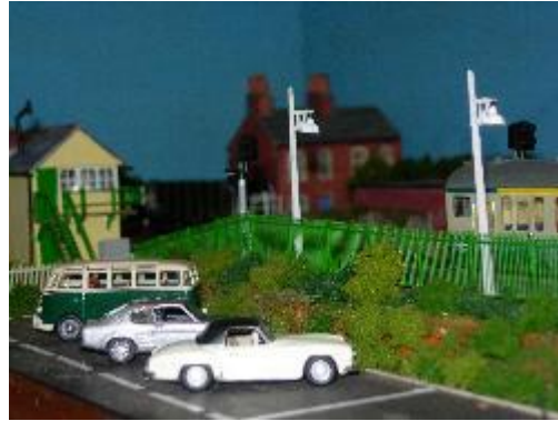
Awaiting passengers in the car park.