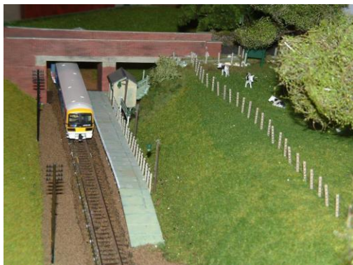
466 'Networker' arrives at Chevening.